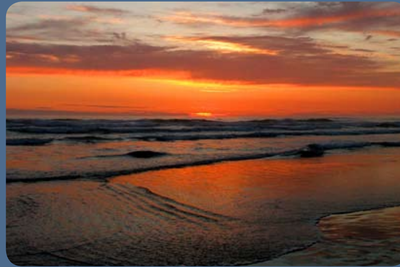
Above: Sunset at Cannon Beach. Cover: Seastacks at Cannon Beach.

Thank you for your generous contributions to our work this year. Your support is more critical than ever as we work to preserve Oregon's livability for future generations. Please use the envelope in this issue to make your tax-deductible donation today. You can also contribute online at www.friends.org/support .