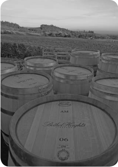
Barrels at Bethel Heights.