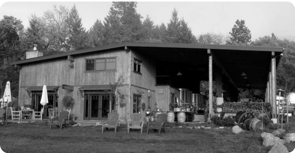
Wooldridge Creek Winery and tasting room.

1000 Friends of Oregon would like to thank our local hosts for allowing us the opportunity to hold these conversations in some of the most beautiful places in the state. Without you, none of this would have been possible.